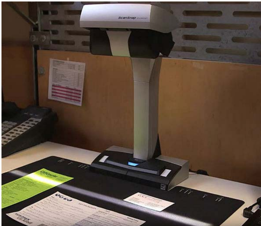
Fujitsu ScanSnap SV600 Contactless Scanner

Watch this cool video to see a scanner like no other!